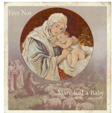
Available Fret Not CDs - Hundredfold (2001), Gloryland (2006), and Mary Had a Baby (2003)